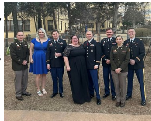
Bravo Leadership attended the Battalion Commander's Holiday Social

The Bravo Brawlers came back from Holiday Block Leave on 04 January. On the 5th, the Bravo Air and Rail Load team conducted training on Fort Sill, ensuring readiness for the CRF mission. On 06 January, Bravo Battery participated in the Battalion Command Sergeant Major Change of Command ceremony. Battery leadership attended the Battalion Commander's Holiday Social. On 12 January, the Brawlers qualified on their M4 Carbines with a 100% pass rate, and three soldiers qualified expert.