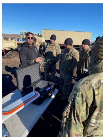
Soldiers getting hands on exposure to the drone buster