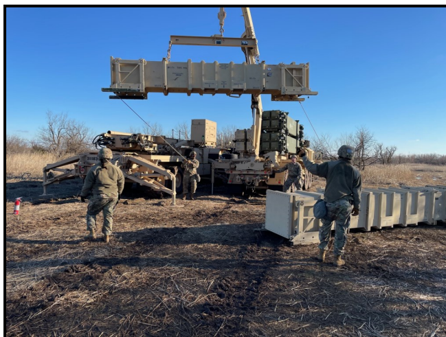
Alpha Battery conducting a reload drill.