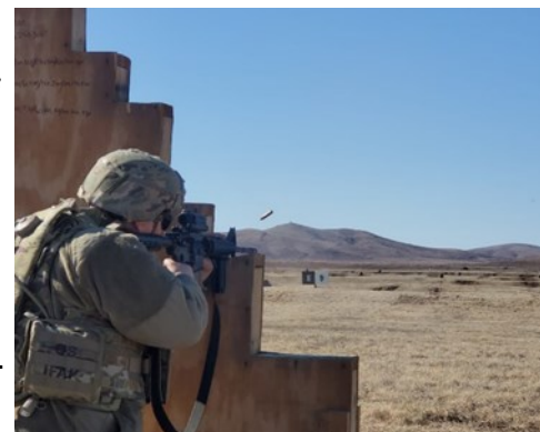
Bravo Soldiers qualified on their M4 weapon systems

Bravo Battery continues to press forward and prepare for the upcoming Table VIII Field Training Exercise in March.