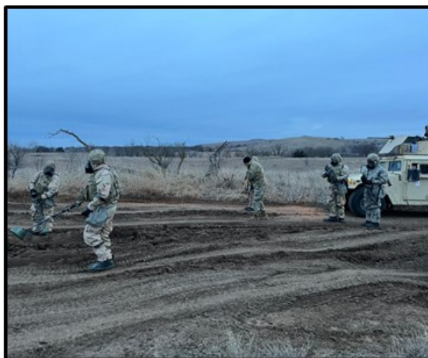
Soldiers from A/3-2 executed RSOP operations when the unit deployed to the field to execute stand alones for Table VIII certifications.