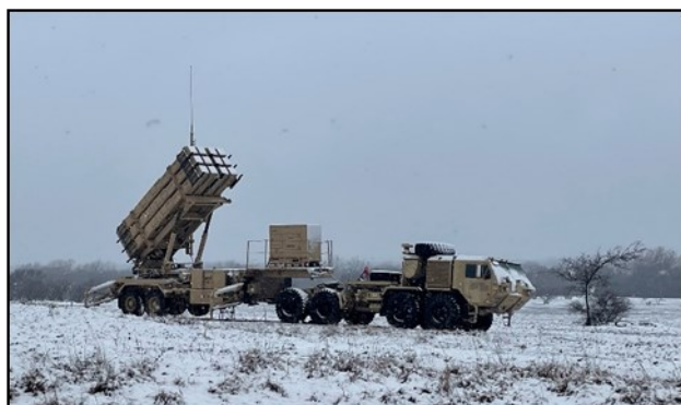
Throughout the second half of January, units conducted convoys, stand alone training, drivers training (day/night), and site security. The weather was not always the best but the units made it happen!