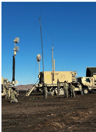
COM; their January our Table OF