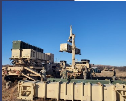
Launcher Platoon Soldiers conduct a missile reload during the FTX

On 23 January, Bravo Battery rolled out to the Training Areas for their Field Training Exercise. They came back the same day because the 24th was a snow day. Bravo headed back out on the 25th and stayed out there in the cold until the 27th. The Soldiers put in a tremendous effort and certified on the 27th, allowing them to come out of the field a couple of days earlier.