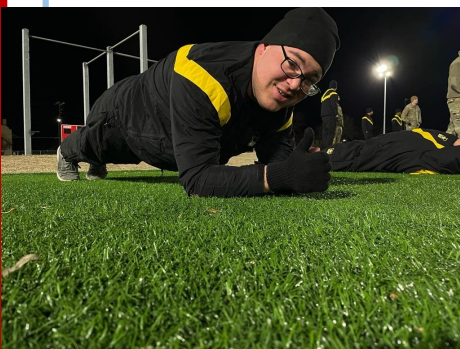
C/3-2 conducts ACFT!