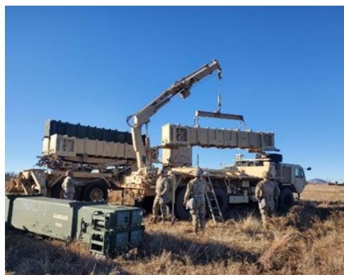
Units executed reload training and certification in the field IOT sustain readiness and maintain crew proficiency.