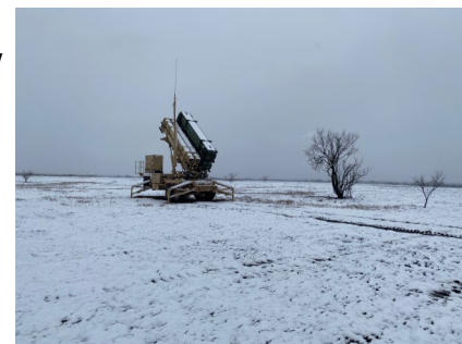
Launcher covered in Snow while in the field