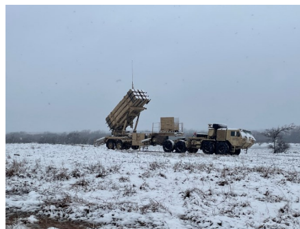
Launcher covered in Snow while in the field

ary and head into February we will commence preparation for upcoming VIII certifications. ONE US!!