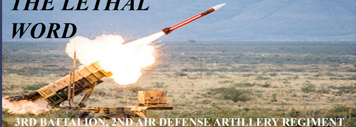
3RD BATTALION, 2ND AIR DEFENSE ARTILLERY REGIMENT