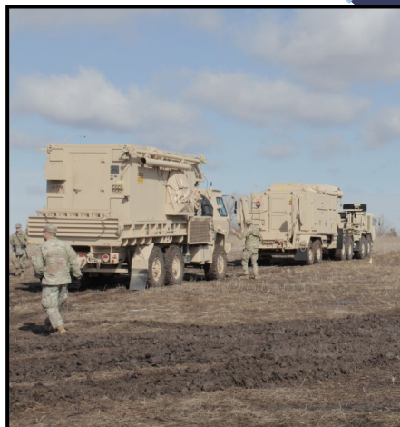
Alpha Battery conducting an emplacement drill.

In the coming month, the Battery will continue to build proficiency in gunnery functions to prepare for Battery-wide Table VIII certifications in March. Soldiers will also participate in the Lethal Strike Warrior Competition, CLS course, and multiple officer and leader professional development classes.