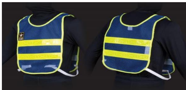
Blue Reflective Vest Drill Sergeants

d. Organizations that wear vests for identity purposes will ensure respective Drill Sergeants and Instructors are the only individuals wearing the vest. Support Cadre, and staff will not wear a vest when conducting PRT. The following pictures depict proper wear of vests on Ft. Sill.