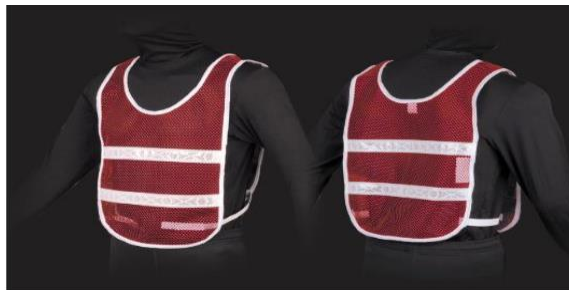
Red Reflective Vest Instructors

e. Unless running on a closed road or circuit, personnel will always run on the side of the road that faces oncoming traffic (left side).