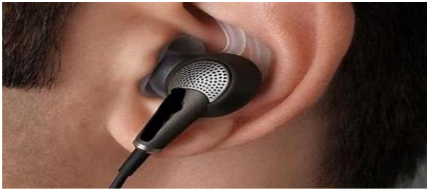
Authorized (1 ½ inches)

centers (including their tracks) or on the 3-Mile Track. Soldiers may not wear headphones beyond the permitted area in any manner, including around the neck or attached to the uniform. Headphones will be conservative and discreet. Ear pads will not exceed 1-1/2 inches in diameter at the widest point. Soldiers may wear electronic devices, such as music players or cell phones, as prescribed in AR 670-1, paragraph 3- 6a(2)(b). They may also wear a solid black armband for electronic devices in the gym or at fitness centers. Soldiers may not wear the armband beyond the permitted areas listed above. The above-mentioned allowances are not allowed during organizational, unit, or tactical PT sessions. Also, Soldiers are not allowed to broadcast music from their cellphone at any time while in any uniform. See images for reference.