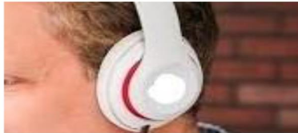
Not Authorized (over 1 ½ inches)