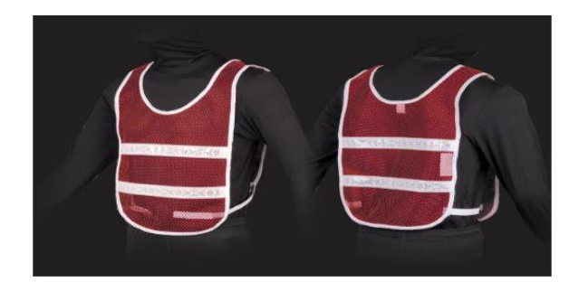
Red Reflective Vest Instructors