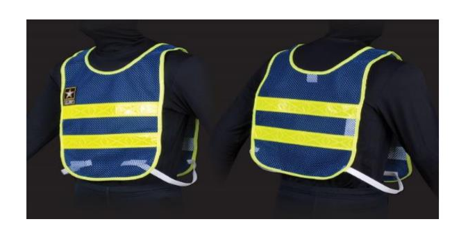
Blue Reflective Vest Drill Sergeants