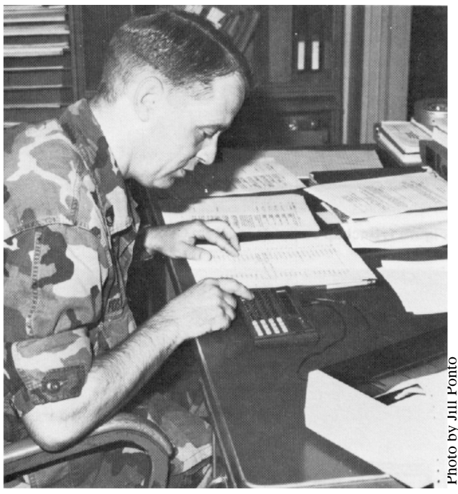
The backup computer system features the Hewlett-Packard 71-b hand-held computer as its hardware.

The Doctrinal Management Office will continue to develop creative methods to ensure that field artillery literature is dynamic and reliable. However, field artillerymen serving in units must also provide impetus to improve artillery employment doctrine. Become a part of the process by responding to the outlines and circulars mentioned above; or send your comments, suggestions, or questions regarding doctrinal literature to the Department of the Army, Commandant, US Army Field Artillery School, ATTN: ATSF-DD, Fort Sill, OK 73503-5600. You may also call at AUTOVON 639-4225/4240.