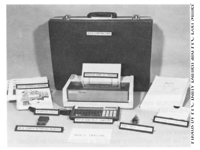
Figure 2. Backup computer system Special.