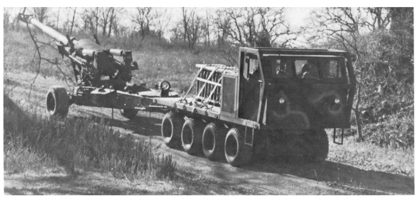
The medium combat truck is being considered as the prime mover for the M198 howitzer and the AN/TPQ-36 and AN/TPQ-37 radar systems.